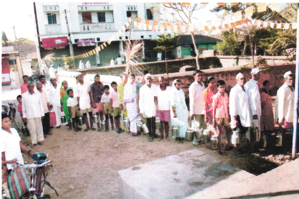
Queue For Milk Suppliers Of Kamdhenu DCS Sulkud